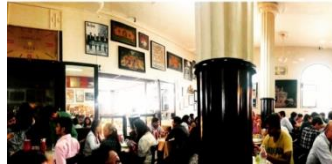
➤ Meeting new people in Kolkata

Also, I visited my friend in Kolkata, who had invited me to