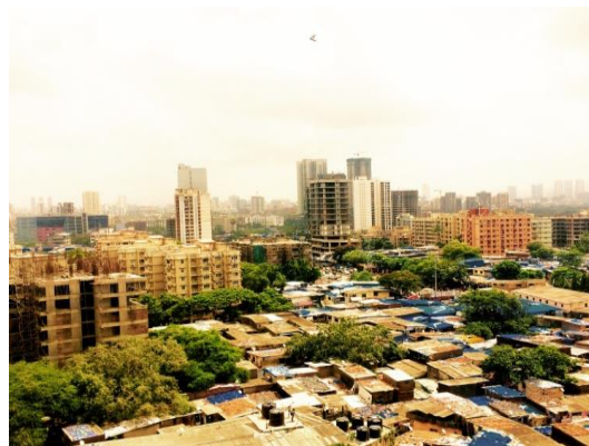
➤ Skyscrapers & slums in Andheri West, Mumbai

In short, India is a country of extremes! It is one of the greatest economies in the world and home to some of the richest and most influential people in the world while at the same time, it has some of the biggest and poorest slums in the world. It is extremely beautiful but at times extremely dirty and polluted. It has a rich heritage and history in aspects like Medicine, the Natural Sciences and Art, while retaining high illiteracy amongst its population. The friction between deep-rooted traditions and modernization is rampant. You can notice such extremes even amongst people who visit it; people either absolutely love it or absolutely hate it! And I, for sure, belong to the first category.