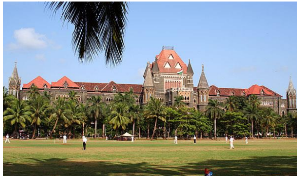
➤ The Honorable Bombay High Court

issuing debentures under s71 of the Companies Act, and whether specific performance clauses are upheld in the UK and India