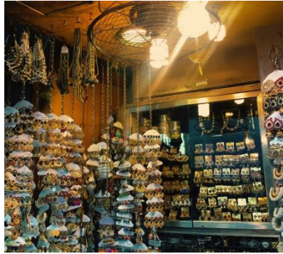
➤ Jewelry at the Colaba Market

There are endless of choices about how to spend your free time in Mumbai; libraries, museums, sightseeing, local markets, shops, shopping malls, restaurants, cafeterias, bars and amazing nightlife! Everything seemed so cheap compared to London prices!