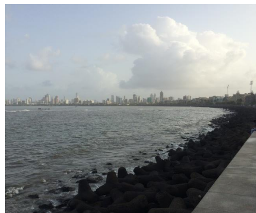
➤ Nariman Point, Mumbai

ALMT Legal is a medium-size multi-practice international law firm with Indian expertise, based in Nariman Point, Mumbai, with offices also in Bangalore and London. It is a leading firm in India and its strongest departments are litigation and the corporate one.