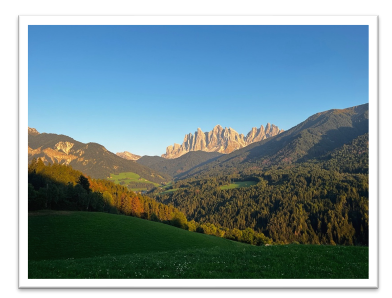
Figure 5: Villnöß, Italy