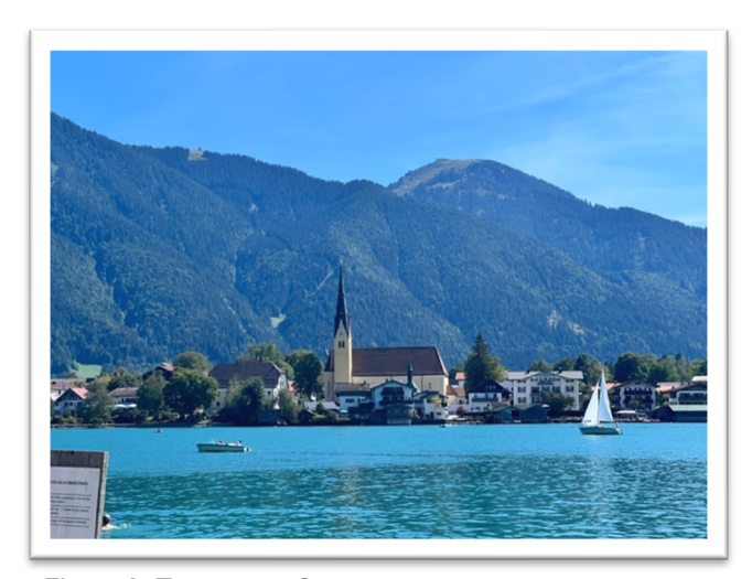
Figure 3: Tegernsee, Germany

Staying in Central Europe also provides easy access to neighbouring countries. I took full advantage of this and booked a car to travel around the Alps. During my road trip, I went on the longest Alpine coaster in Austria, went on several hikes, drove to the Dolomites in Italy, and saw the Milky Way for the first time in my life.