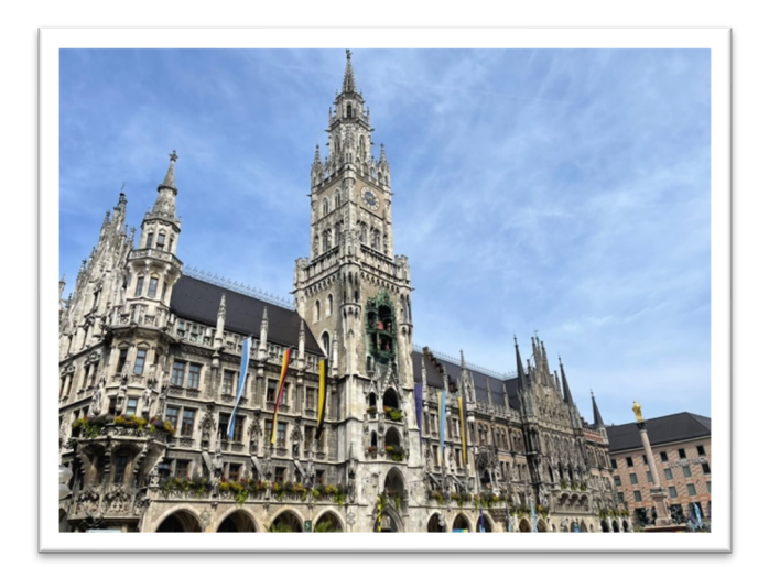
Figure 1: Neues Rathaus (New Town Hall), Munich, Germany

Throughout the four-month internship, I focused on developing a unit converter for the electromagnetic compatibility software ELEKTRA, utilising WPF (C# and XAML). Beyond acquiring technical proficiency, the experience also allowed me to hone my soft skills by adapting to collaborative team dynamics, understanding cultural nuances in a work environment, and engaging with stakeholders. I anticipate that