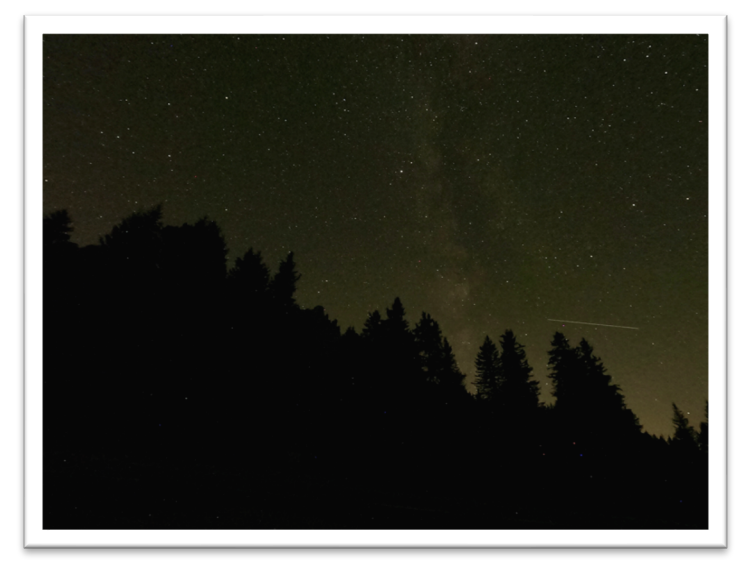
Figure 4: Gasthaus Edelweißhütte, Villnöß, Italy

There are also several stunning lakes in the immediate vicinity of Munich. My favourites were Tegernsee, Walchensee, and Königssee. The atmosphere at these lakes contrasts the bustle of Munich completely – perfect places for a weekend getaway.