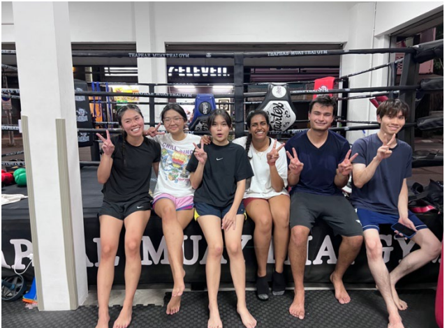
[ We partook in many activities during our stay in Thailand with the other volunteers and this included learning to cook Thai classics and learning the basics of Muay Thai]

The Wildflower Home, is a place that provides safety, education, healthcare, and other support to women in crisis, providing a haven for these women to stay without facing any unlawful and immoral discrimination. Upon arriving at the Wildflower Home, I was surprised by how many young women were staying at the home and how many of them had children very young due to child marriages. During my stay, I was extremely grateful for the environment I was brought up in and the great importance that was put on education and completing school. Many of the ladies I spoke to were telling me about how they would love to go back to school, to learn more and to educate themselves, to provide a better future for themselves and their children. I found myself feeling very grateful and very thankful for the various opportunities I was surrounded by and being able to stay single and focus on personal growth and career without having to be pressured into marriage so young.